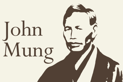
John Mung (Nakahama Manjiro) 1827-1898