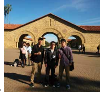
At Stanford University